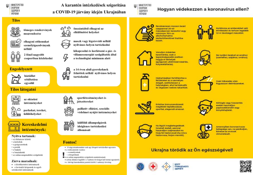
Picture 7. Precautionary statements in Hungarian developed by the Ministry of Health

In Transcarpathia, multilingual signs have a history and we can find many cases in previously published studies where we can see interesting, creative solutions for their multilingualization. Picture 8 is also a trilingual (Ukrainian-Hungarian-English) poster made in order to curb the spread of COVID-19, on which the traditional Transcarpathian multilingualism prevails – the three languages are separated by different colors, and the essence of the message is illustrated with clear drawings. A multilingual poster is just as informative as a monolingual one but it can reach a broader audience. In many cases, multilingualism also has a symbolic significance,