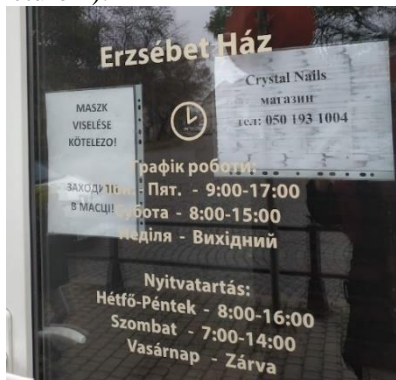
Picture 1. Inscriptions in Ukrainian and Hungarian in a beauty salon (Berehove, 14.02.2022)

On the other hand, as the opening hours of the shops have been restricted on several occasions, customers were also informed about alternative shopping options. During the first full lockdown, store owners faced an unprecedented situation and tried to connect with their customers in several ways: the most widespread solution in Berehove was that in addition to the captions that could also be read on the street front, the telephone numbers of the store managers appeared in the form of temporary signs (see the beauty salon in Picture 1).