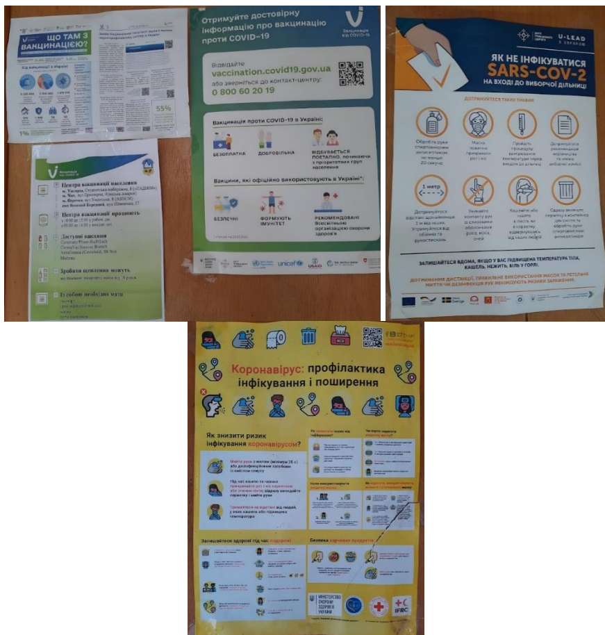
Picture 6. Posters distributed by the Ministry of Health of Ukraine