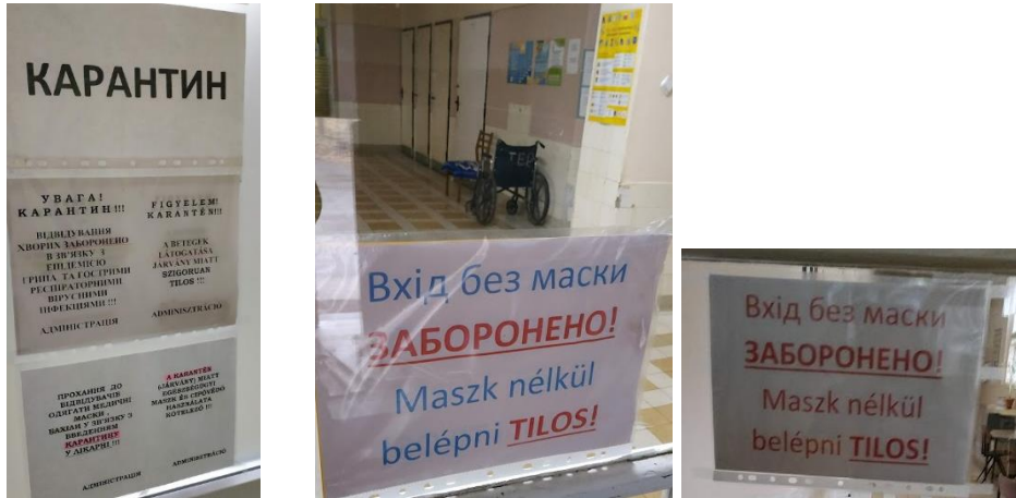
Picture 5. COVID inscriptions of the Berehove hospital in Hungarian and Ukrainian-Hungarian (22.06.2021)